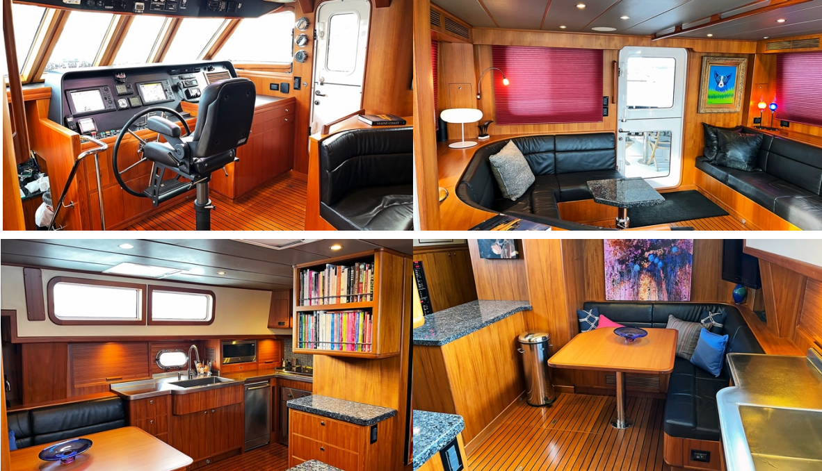
LAYOUT: Upper Level – Aft Deck and Saloon/Pilothouse: